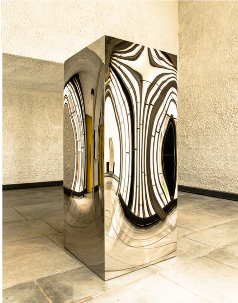
Anish Kapoor, Non-Object (Door), 2008