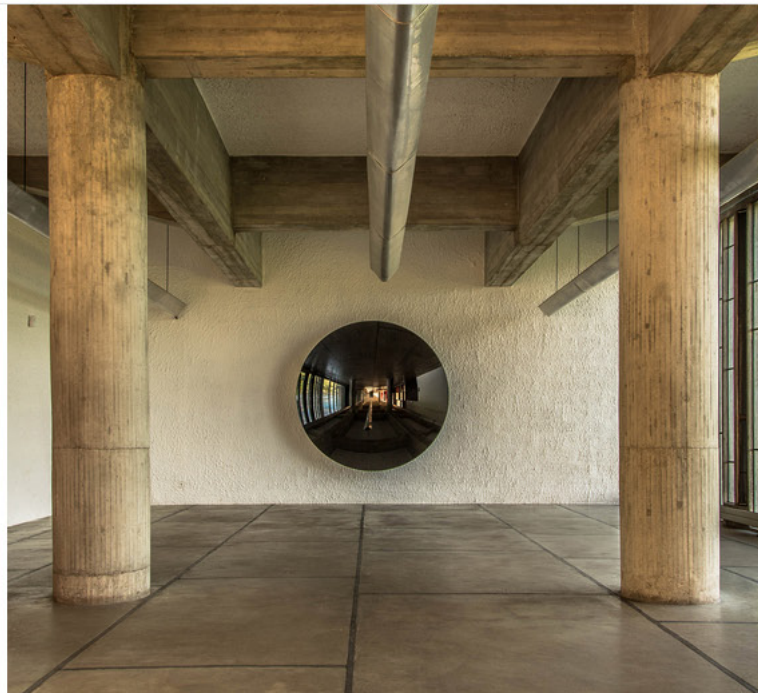
Anish Kapoor, 220 Aluminium Mirror, 2011

Couvent de la Tourette, a modernist monastery built for Dominican Friars in 1960, invited the artist to showcase 13 works in the space.